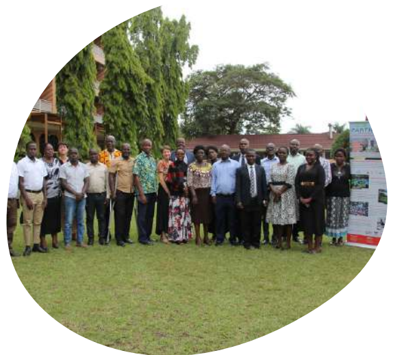
Stakeholders engagement to develop the urban agriculture strategy and action plan, March 2023 at Hotel Africana

The objectives are to improve the service delivery to urban farmers with up-to-date data collection, traceability tools and diversify funding.