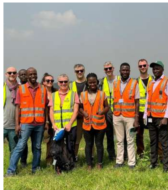
Members of the green spaces teams from Kampala and Strasbourg during the exchange mission in February 2024

Management guidelines and tools - with the foundation of data collected in the audits, the team is developing a tree and green space management tool and guide. These tools will inform the allocation of resources towards the management of the City's natural assets.