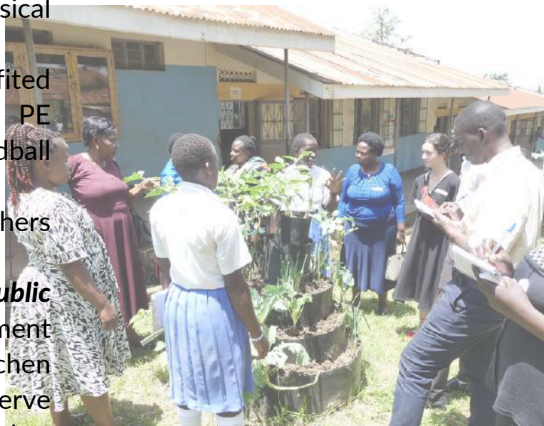
Young farmers' clubs in primary schools - kitchen gardens established in the participating schools

Vegetable gardens in schools - 10 public primary schools received gardening equipment and were supported to establish kitchen gardens. The vegetable gardens not only serve to improve the food options for the pupils but also complement their learning outcomes through project-based teaching and learning.