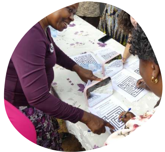
Capacity building on inclusive education with the Kitebi P/S teaching team