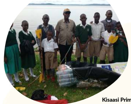
Kisaasi Primary School at the boat competition March 2023