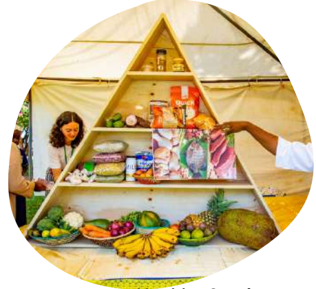
Nutrition Stand, Food event, June 14, 2024

The Agriculture and Production team organized and held the first food event of Kampala on 14 June 2024 to highlight the potential of urban farming to address the nutrition, livelihood and sustainability challenges in the City . The event saw the participation of around 200 people who came to learn from farmers exhibiting farming technologies and products, and classes on nutritious meal preparation.