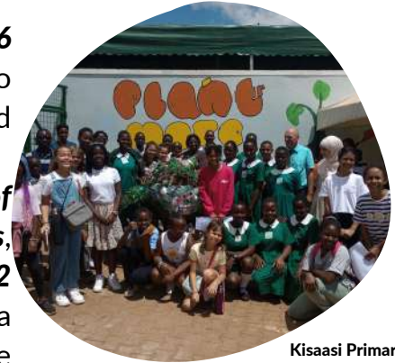
Kisaasi Primary School and International French School April 2024