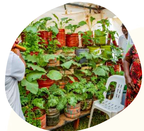
Food event, farmers exhibitors, June 14, 2024