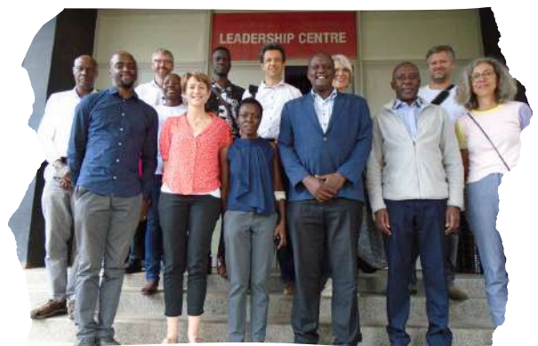
Strasbourg team's mission in Kampala - October 2022

The objective of the Project is to build a greener, more sustainable, and inclusive city by developing and implementing actions in the three priority areas of urban agriculture, green spaces, and education.